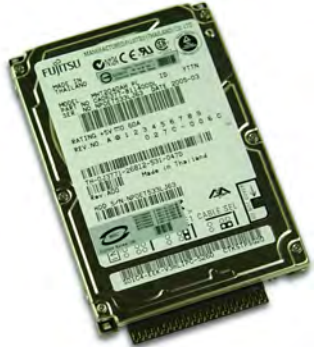
Laptop Hard Drive